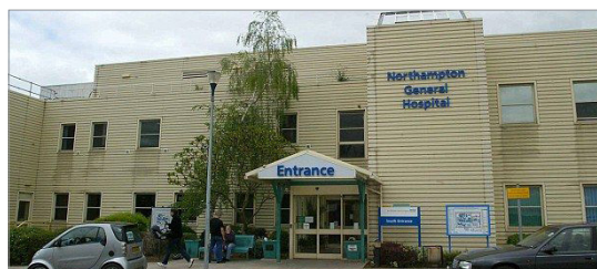
Figure 1. Northampton General Hospital

Ultracore Plus (Fig. 3) is a static, hybrid mattress consisting of a foam U-core and a Repose inflatable inner. It uses proven immersion and envelopment technology for patients at risk of, and up to grade 2 pressure damage. The mattresses are suitable for use on high low beds as well as standard, profiling beds and has no electrical pump - reducing patient disturbance from associated noise. For these reasons, it was felt that it could meet patients pressure redistribution needs whilst on a bed suitable to address their falls risk.